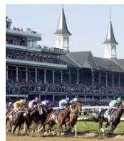
Fun Night - Night at the Races

Experience the excitement of a day or night at the track with video horse races. Photo finishes, instant replays, official results, and payouts according to the live odds are given